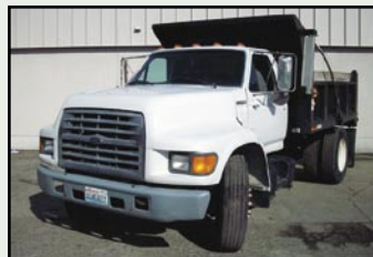
FORD F-650 6-YARD DUMP TRUCK