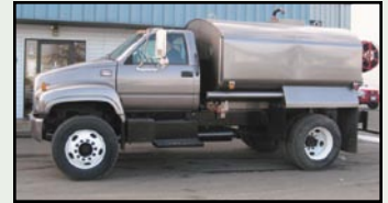
1997 GMC 7500, w/UNUSED RANDCO 2,500-GAL. TANK SYSTEM