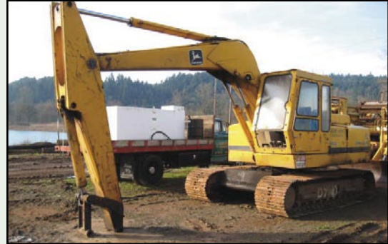
JOHN DEERE 690 EXCAVATOR