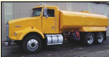
KENWORTH T800, w/UNUSED SMITH 4,000-GAL. TANK