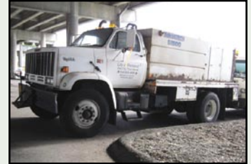
1990 GMC 7000 CATCH BASIN CLEANER