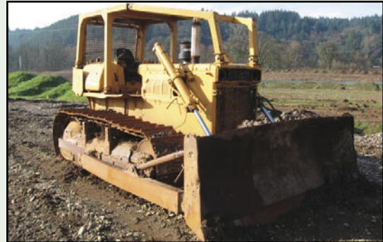
KOMATSU D65E CRAWLER TRACTOR