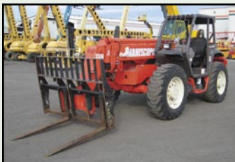
(1 OF 2) MANITOU 8,000-LB. 4x4 REACH FORKLIFTS