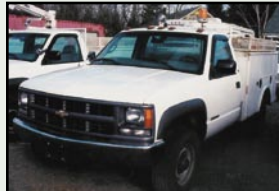
CHEVROLET 3500 4x4 SERVICE TRUCK