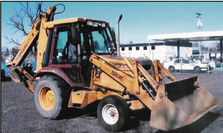
CASE 580K BACKHOE