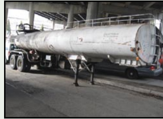
TRANSPORT 6,000-GAL. T/A ASPHALT TRAILER