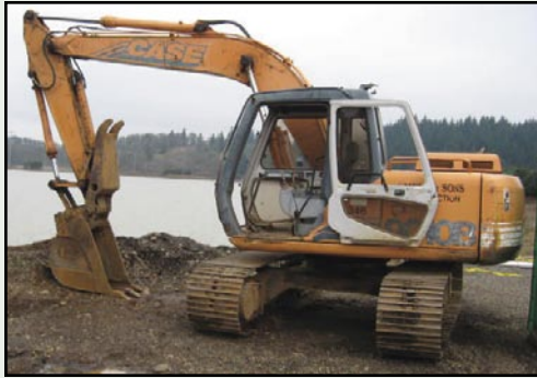
(1 OF 2) 1996 CASE 9010 EXCAVATORS