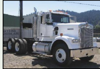
1998 KENWORTH W900B TRACTOR