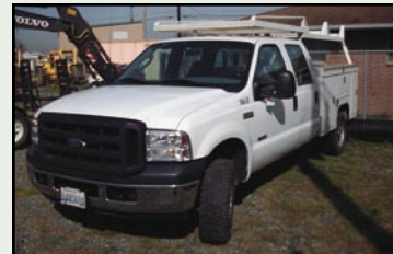
(1 OF 4) 2005 FORD F-350 4x4 CREW CABS