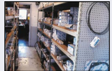
PARTIAL VIEW OF NEW PARTS INVENTORY

We Will Also Auction the Entire Shop Equipment Inventory, Including: Air compressors, impact wrenches, tools, steel workbenches, engine, transmission, and gearhead stands, chop saws, hyd. shop press, (3) large cabinet safe clean parts washers, lathe, drill presses, grinders, Matco A/C machine (used once), Parker hyd. hose machine, pullers, seal drivers, socket sets, floor and bottle jacks, hoses, special engine tools, and a large quantity of parts shelving.