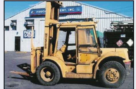
HYSTER 20,000-LB. FORKLIFT