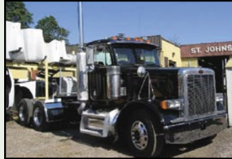
2003 PETERBILT 379 T/A TRACTOR