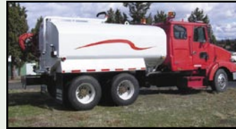
1992 WHITE-GMC T/A, w/UNUSED RANDCO 3,200-GAL. TANK