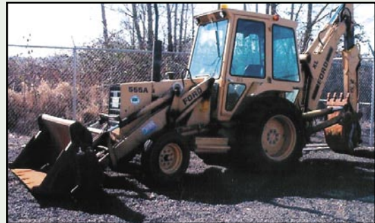
FORD 555A BACKHOE