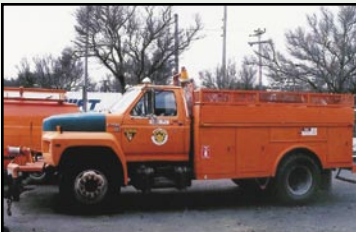
FORD F-700 SERVICE TRUCK