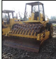
< CAT CP553 84" PAD FOOT ROLLER