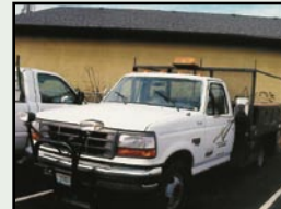
FORD F-350, w/SNOWPLOW