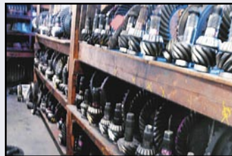
PARTIAL VIEW OF RECONDITIONED GEAR SETS