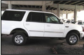
2000 FORD EXPEDITION