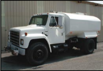
IHC 2300 SA, w/UNUSED SMITH 2,300-GAL. TANK