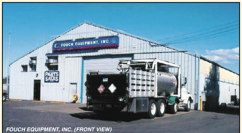
FOUCH EQUIPMENT, INC. (FRONT VIEW)

INSPECTION: Daily Beginning Saturday, March 22, 2008 • 8:00 A.M.–4:00 P.M.