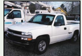
1999 CHEVROLET 1500 SHORT BOX