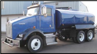
KENWORTH T800 T/A, w/UNUSED RANDCO 4,000-GAL. TANK SYSTEM