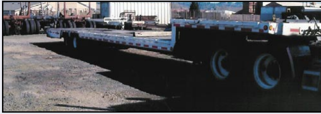
1999 DYNAWELD 45' HYDRAULIC BEAVERTAIL EQUIPMENT TRAILER