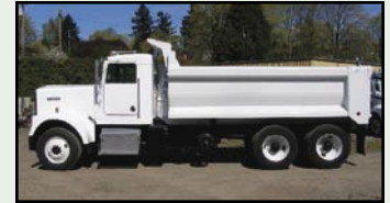
1999 KENWORTH W900B T/A DUMP TRUCK