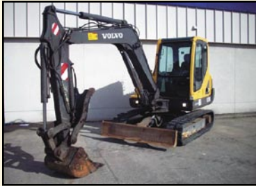
2004 VOLVO EC55