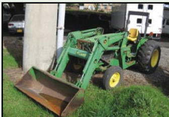
JOHN DEERE 970 TRACTOR, w/FRONT LOADER