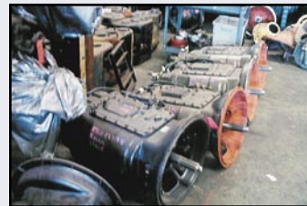
PARTIAL VIEW OF REBUILT AND REFURBISHED TRANSMISSIONS