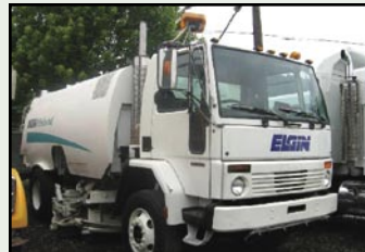
2000 STERLING C8000, w/ELGIN WHIRLWIND SWEEPER