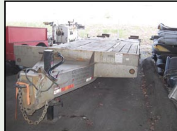
INTERSTATE TD24 PINTLE-HITCH TRAILER