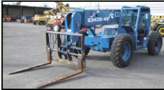
1998 GRADALL 534C9 9,000-LB. 4x4 REACH FORKLIFT