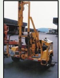
UNDER DAWG CABLE PULLER