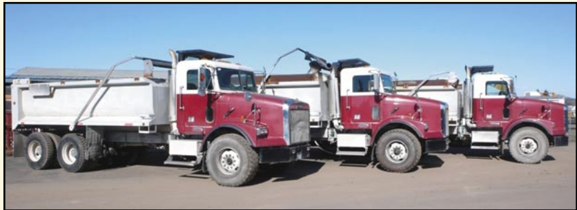
(3) 2004 FREIGHTLINER FLD112SD DUMP TRUCKS

Tuesday, March 25 & Wednesday, March 26, 2008 • 9:00 A.M. Each Day