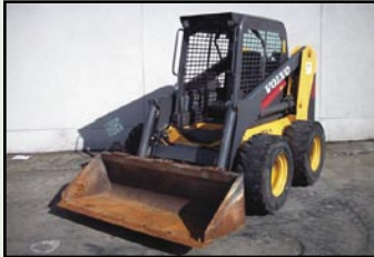
2004 VOLVO MC110 SKID STEER