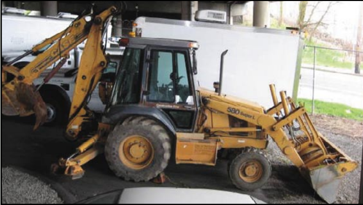
1996 CASE 580L 4x4 BACKHOE