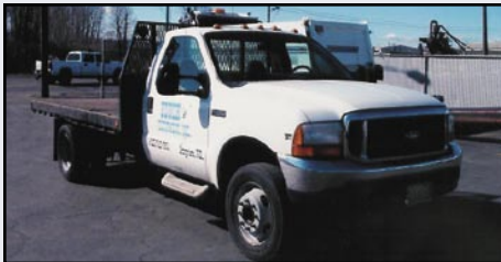
1999 FORD F-450 FLATBED