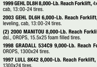
1999 GEHL DL8H 8,000-Lb. Reach Forklift, 4x4x4, John Deere dsl., 42' 3-stage reach, hyd. leveling, cab, 13:00-24 tires.