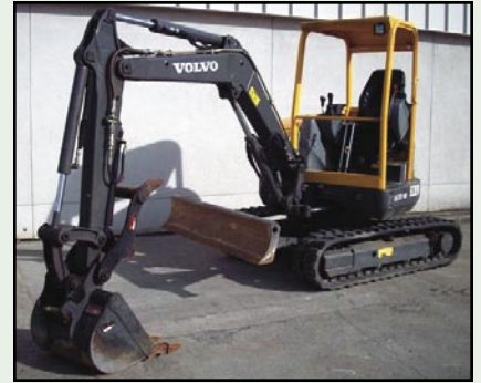
2005 VOLVO ECR38