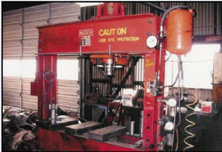
LARGE HYDRAULIC SHOP PRESS