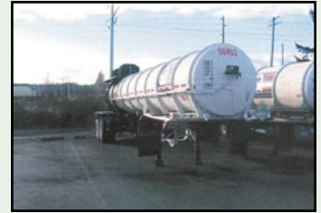
(1 OF 3) 5,000-GAL. RUBBER-LINED TANKERS