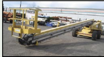
GROVE MZ116C 4x4 110' BOOM LIFT