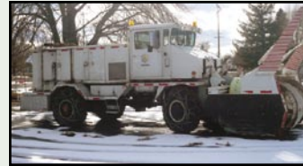
IDAHO RLA 4x4 SNOWBLOWER