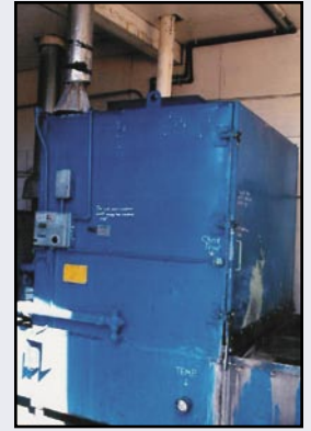
(1 OF 3) SAFE CLEAN CABINET PARTS WASHERS