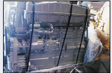
REBUILT CUMMINS BC-III, 400 HP.