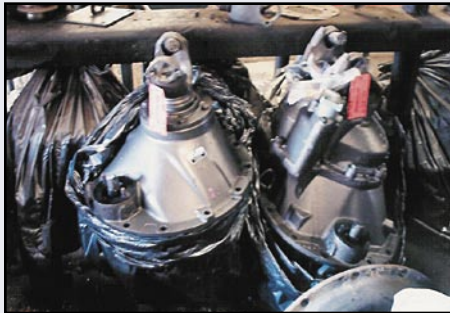
(2) OF A LARGE QUANTITY OF REBUILT & RECONDITIONED GEAR HEADS