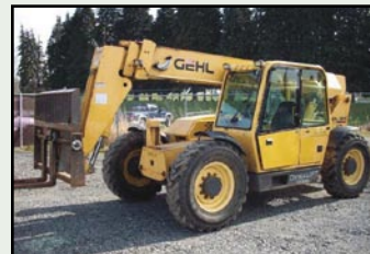
(1 OF 2) GEHL DL8H REACH FORKLIFT