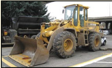
1994 JOHN DEERE 544G WHEEL LOADER