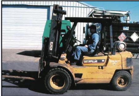
CAT 8,000-LB. FORKLIFT