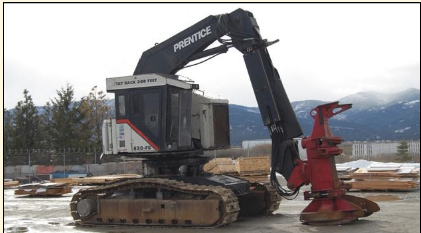
2002 PRENTICE 620 FELLER BUNCHER