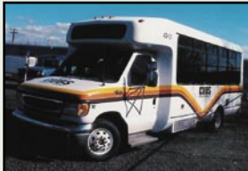
(1 OF 2) 2001 FORD E-450 13-PASSENGER BUSES, w/WHEELCHAIR LIFT