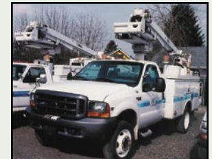
1999 FORD F-550 4x4, w/35' BUCKET