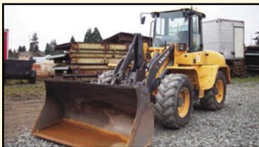
2005 VOLVO L45 WHEEL LOADER

Retirement Auction for Fouch Equipment, Inc. (After 55 Years in One Location)