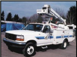
(1 OF 3) FORD F-450, w/35' BUCKET