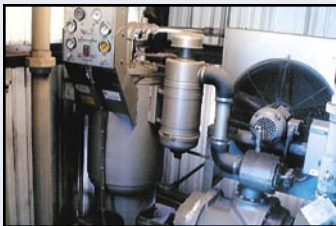
QUINCY 50 HP. SCREW AIR COMPRESSOR, w/AIR DRYER