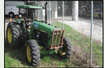
JOHN DEERE 2355 4x4 TRACTOR