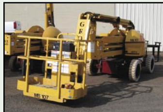
1997 GROVE AMZ39NE ARTICULATING BOOM LIFT