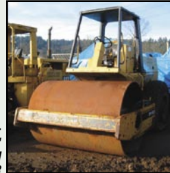
> CAT CS553 84" SMOOTH DRUM ROLLER