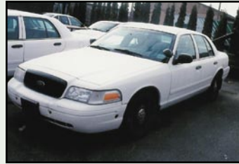
(1 OF 11) 2005-2000 FORD CROWN VICTORIAS