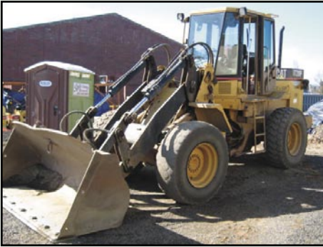
1994 CAT IT28F TOOL CARRIER