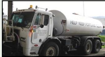
1994 PETERBILT 320 T/A, w/4,000-GAL. WATER TANK SYSTEM