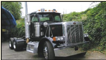
2002 PETERBILT 379 T/A TRACTOR